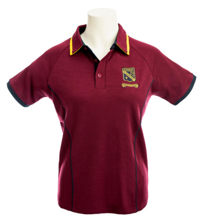
☐ Polo shirt (11-12)