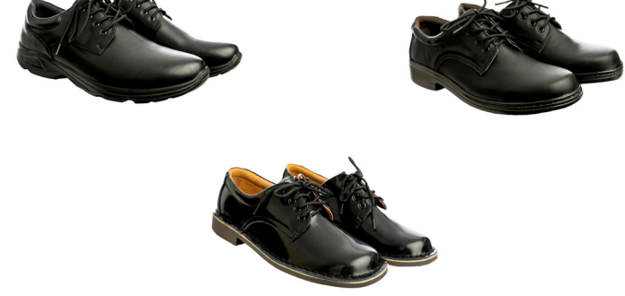
T-Bar, Mary Jane or Boot styles not allowed